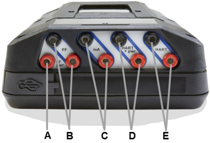
Figure 3: Device Communicator Plus communication module